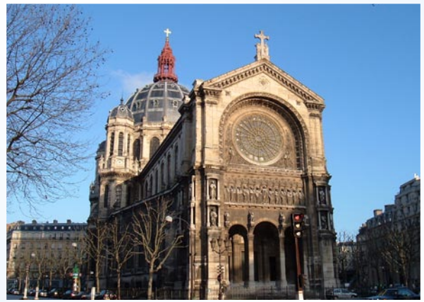
▲ St Augustine, one of many magnificent churches in Paris