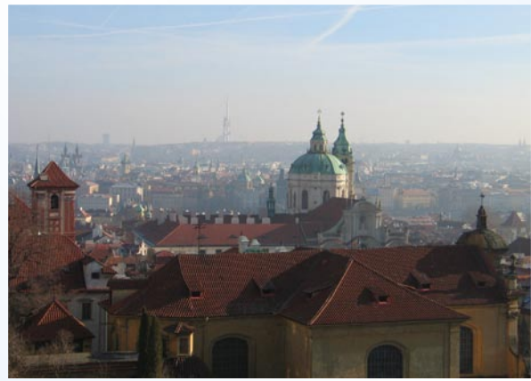
▲ View from Prague Castle